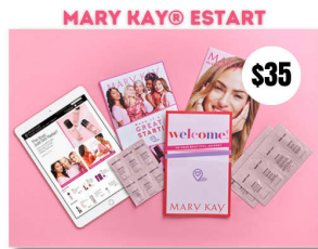
MARY KAY® ESTART